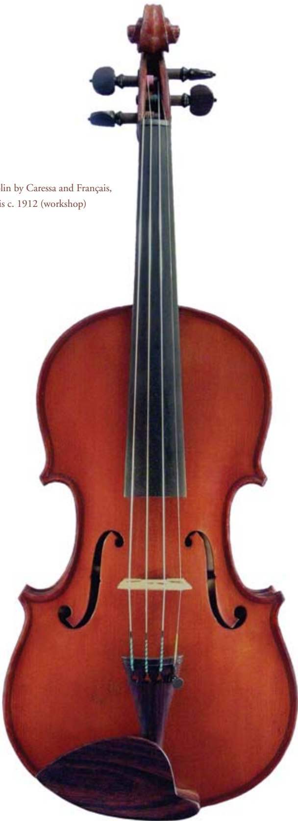
Violin by Caressa and Français, Paris c. 1912 (workshop)