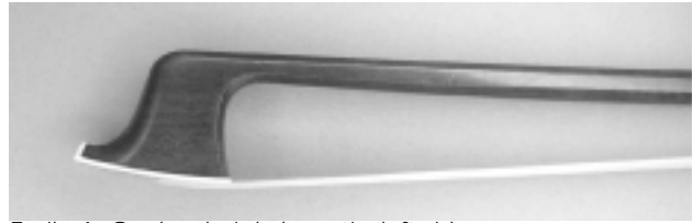
Emile A. Ouchard, viola bow, tip, left side