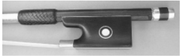
Emile A. Ouchard viola bow, frog

Bam Newtech cello cases are very lightweight (12 lbs) and extremely durable. They have a triple ply composite shell with an Airex skeleton and only five latches. The cases are air and water tight, protecting the instrument from moisture, cold, heat and humidity. Newtech cases are an excellent choice for all cellists, but especially those concerned with protection and ease of use. They come in a variety of colors: mint, black, royal blue, and terra-cotta. List: $824