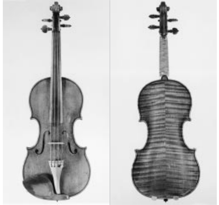
"Lark" Stradivari 1698

It has been crucial to our success to establish firm and trusted relationships with vendors and makers who are responsive to our high standards of quality. We have traveled the world to find makers and develop relationships that allow us to offer the finest instruments and bows in all ranges. We enjoy representing the instruments and bows from a variety of current violin makers, especially those from the very fine modern American school.