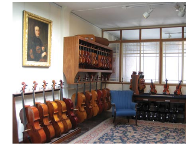
Many of our finest instruments are on display at the Givens Violins showroom.